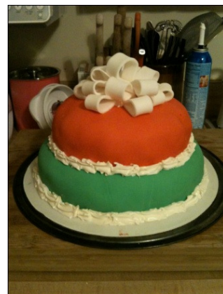
Desert Anyone? Alan's creations may be featured at Detroit's 1917 Bisto.