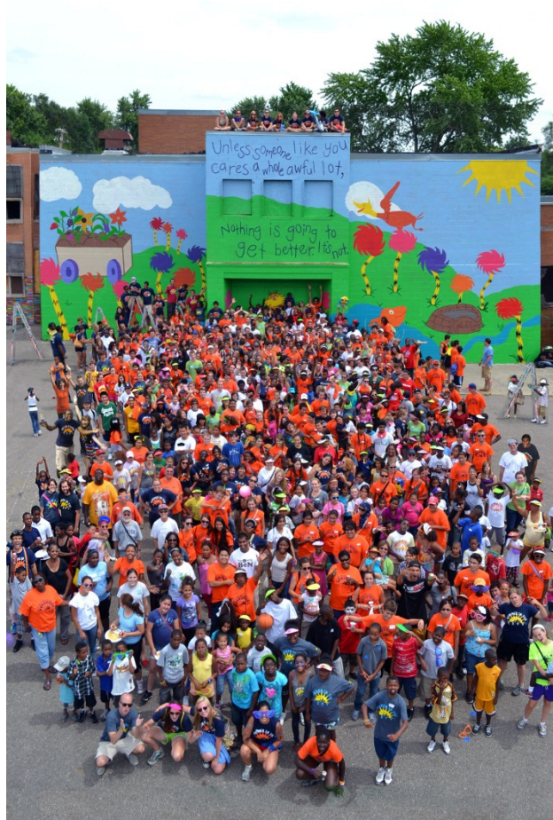
Through the 10 year old Summer in the City program, 6 GDYT placements resulted in more than 30 additional youth being exposed to community service.